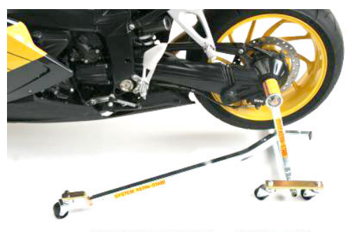
2016N-BMW + 2017RS